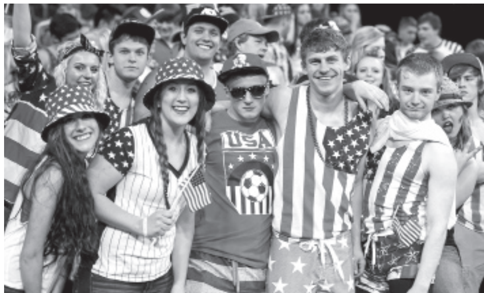
Students show their American pride and school spirit at the basketball tournament.

prepared for yourself and get any teacher or counselor signatures you need to complete the form. Our guidance counselors have been very helpful with giving us resources to help us map out our future high school education course. Visit with your parents, teachers, and guidance counselors prior to making your course selections. They are all here to help.