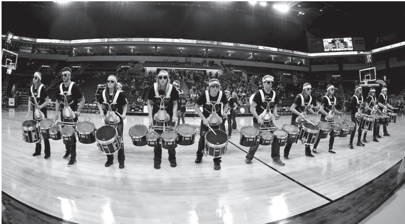
Members of the Pierrecussion drumline during one of their two halftime performances at the state basketball tournament.

The discussion on start and end dates may not be over for good, but for this year, those Riggs students not graduating for a few years better plan on getting to bed early on Aug. 19 because at 8:15 am. on the 20th, the 2015-2106 school year will be underway, whether we like it or not.